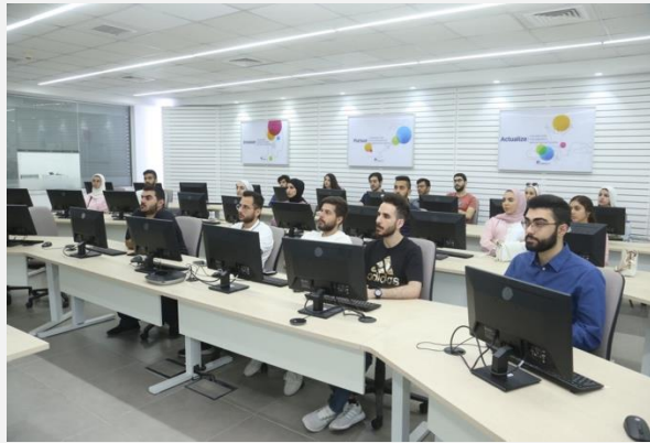
University of Jordan Salesforce Bootcamp Training – First Cohort

The program was successfully concluded in September 2022, shortlisting the best candidates. Out of 16 students attending, Deloitte shortlisted 3 top scorers and recruited 2 candidates.