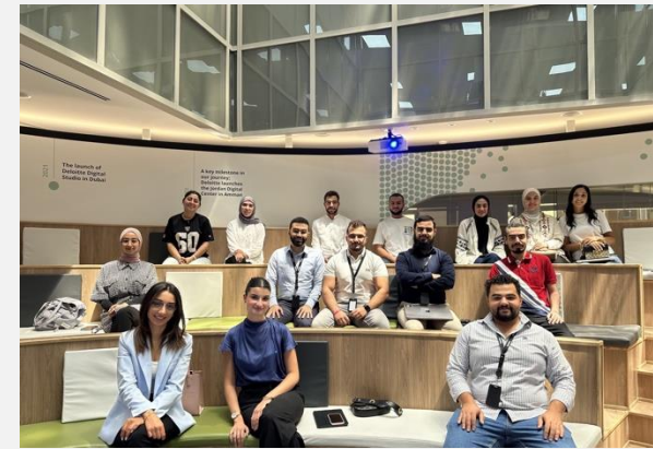
Deloitte's Salesforce Bootcamp Training (HTU, PSUT, GJU) – Third Cohort

The program supported the students to build confidence and embark on their path with Salesforce.