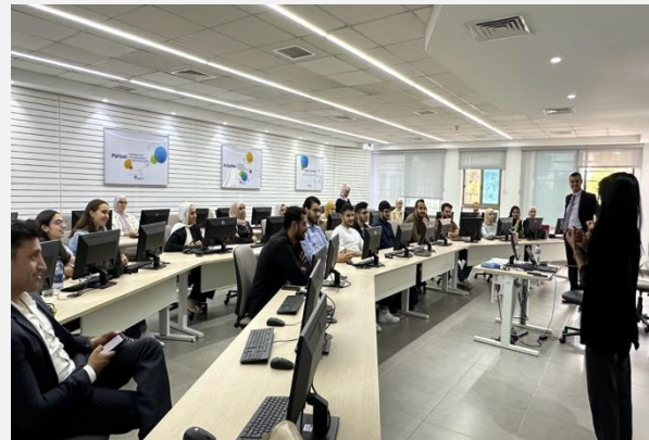
University of Jordan Salesforce Bootcamp Training – Second Cohort

By aligning the program with industry demands, graduate students were better prepared for the job market.