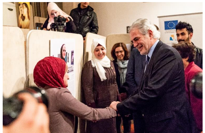
“My Story” exhibition launch

“Because of EDU-SYRIA scholarship, I was able to attain an English language certificate from the British Council. I hope to further continue my higher education and apply for Bachelor and then Master Degrees.”