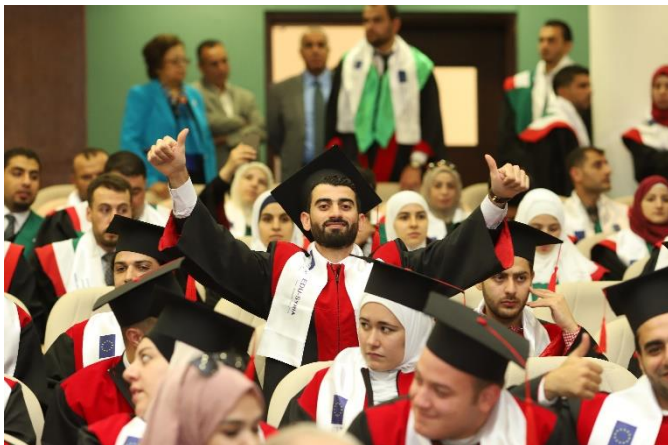
Graduation ceremony

“I was a law student in Syria. When I was forced to leave my country because of the war and fled with my family to Jordan I could not continue my studies.”